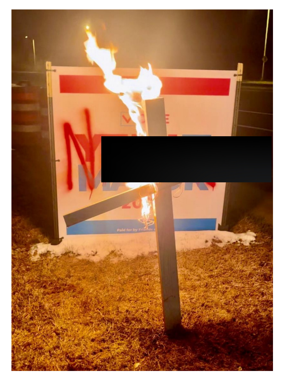
(e) On or about that same day, later in the evening on April 23, 2023, BLACKCLOUD and WEST worked together to send an email (hereinafter referred to as the Angiem11587 email) to, among others, local broadcast news outlets. Attached to the email was the above photograph and the video. Several