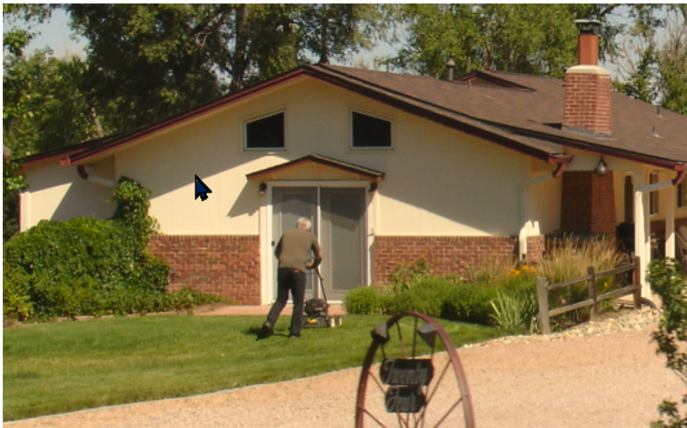
Dennis Hisey mowing lawn of 24 Circle C Road, Fountain, on July 21, 2022