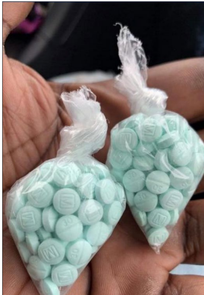
Photo Posted on February 2, 2021, by Another User ("Railsgetdoe Stacks") to a Facebook Group of which Wilkins Is a Member

47. Wilkins also had a significant number of private messages with individuals discussing the distribution of illegal drugs. I have not included all of these messages below and have included only a portion of them necessary to support probable cause for the requested warrant. I have also not included every line of the communications within these messages, however, I have not intentionally left out any portion of the conversation I believe would be exculpatory in nature or would materially change the context of the conversation.