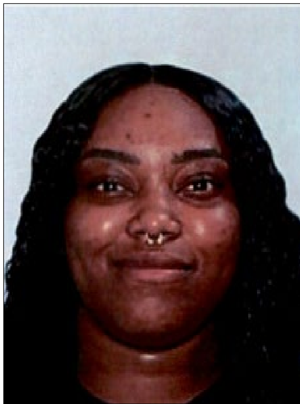
Colorado DL Photo on 9/2/21